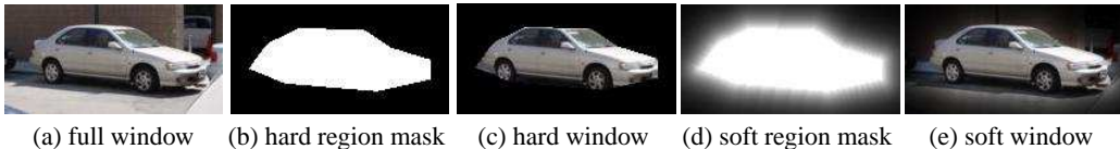
Figure 2: Illustration of soft mask for proposed object regions.

For both approaches, we append the score (for each object) from the object detection classifiers—linear SVM or boosted decision trees—to the object feature vector \phi_o .