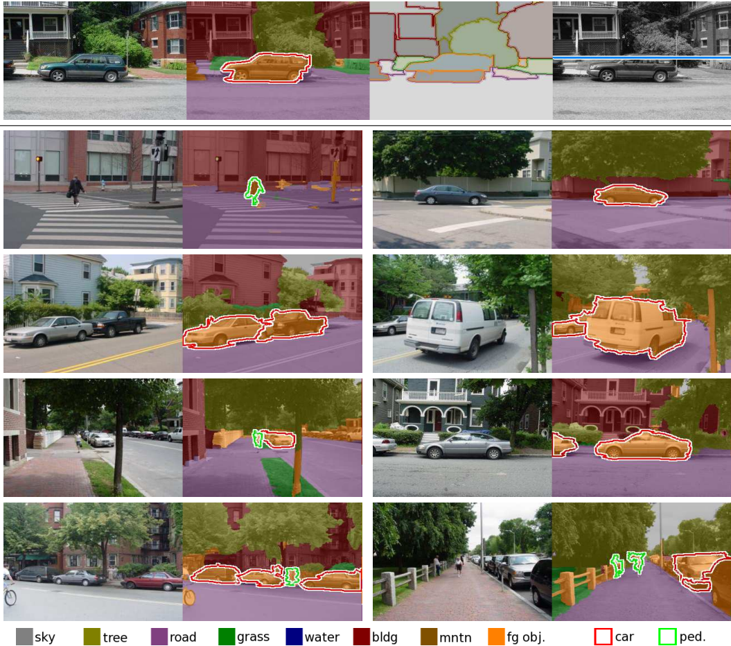
Figure 4: Qualitative results from our experiments. Top row shows original image, annotated regions and objects, region boundaries, and predicted horizon. Other examples show original image (left) and overlay colored by semantic class and detected objects (right).