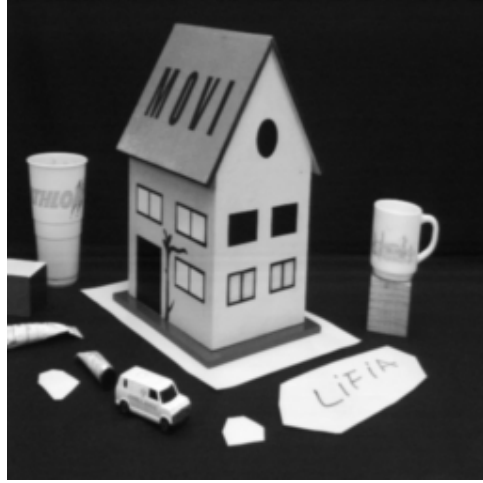
Figure 1: One of the views of wooden houses