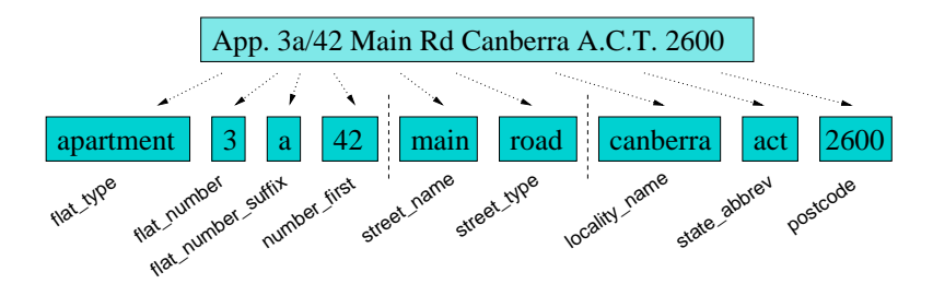
Fig. 1. Example address standardisation. The left four output fields relate to the address site level, the middle two to street level , and the right three fields to locality level

The terms data cleaning (or data cleansing), data standardisation, data scrubbing, data pre-processing, and ETL (extraction, transformation and loading) are used synonymously to refer to the general tasks of transforming source data into clean and consistent sets of records suitable for loading into a data warehouse, or for linking with other data sets. A number of commercial software products are available which address this task. A complete review is beyond the scope of this paper (an overview can be found in [16]). Address (and name) standardisation is also closely related to the more general problem of extracting structured data, such as bibliographic references or name entities, from unstructured or variably structured texts, such as scientific papers or Web pages.