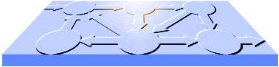
Figure 3. CNR layout.

maintained isolated from the others, and of a specific periodically repeating routing procedure , operations involving the packets of charge stored in the cells. The basic operations consist in applying a charge packet to a storage cell such that the packet's size is proportional to a given positive voltage amplitude ( injection ), in splitting the charge packet of a cell into positive components and transferring these parts into distinct cells previously empty ( splitting and transfer ), in combining charge packets from different cells and transferring them simultaneously into the same cell ( addition ) and in emptying a cell by removing its charge packet from the network while generating a voltage amplitude proportional to the size of the extracted packet ( extraction ).