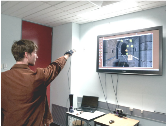
Fig. 1. Selecting a firefly in the select-drag-drop trial using the P5 Wired Glove

The trials presented the tasks consecutively with a brief break between each task explaining what needed to be done before it was begun. At the end of each sequence of tasks, the participant was given a 5-10 minute break to rest their arm before continuing with the next interface device.