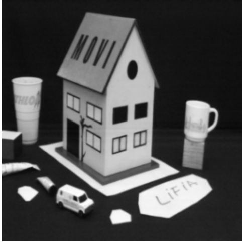
Figure 1: One of the views of wooden houses